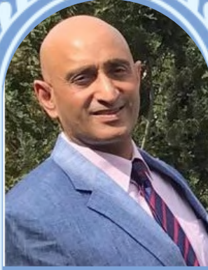
Guest of Honor